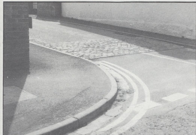
Cobbled surfaces can be dangerous to cyclists in the wet, particularly when they are cornering

But the County Engineer assembled a project team for this publication and congratulations are due all round, not least to the graphics section. If your Chief Executive says: 'What's Traffic Calming?' put this book in front of him. It is the one that enthused Christopher Chope.