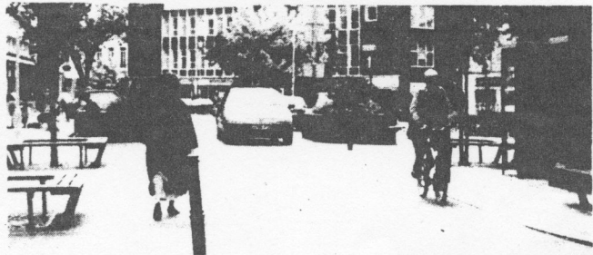
Traffic calming in Exeter

The 185 page book, extensively illustrated in colour, tackles the subject in four sections;